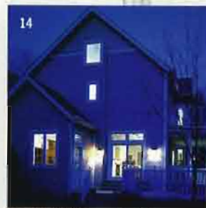
14 FOSTER DALE Foster Dale Architects