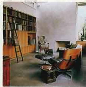
13 DOUGLAS ROSS Ross Architecture