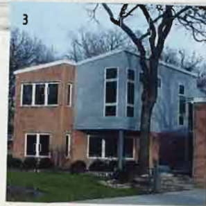
3 DOUGLAS LASCH Lasch Architects