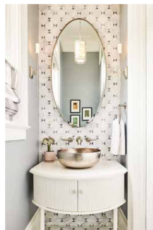
From top: A pair of inviting Hancock & Moore Gordon swivel glider chairs in Holly Hunt's Cloud Nine Grey Mist fabric sit in front of a custom-upholstered king bed with Holland & Sherry's Heilo Coal wool fabric; Uttermost's Petra oval mirror.

"THE AESTHETIC THEY REQUESTED WAS TO HAVE AN ELEGANT COTTAGE FEEL OR A CULTURED CLUBHOUSE."