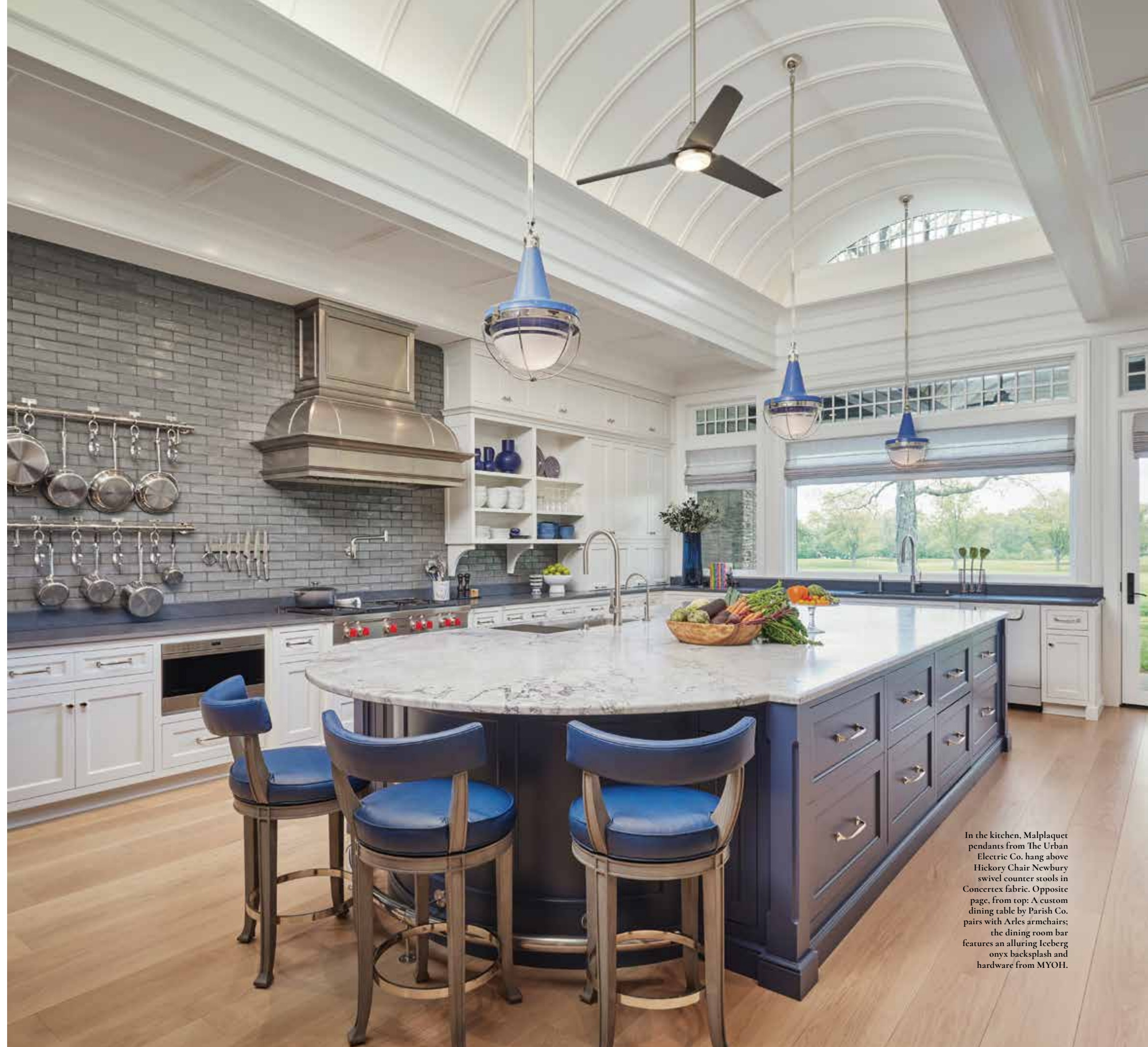
In the kitchen, Malplaquet pendants from The Urban Electric Co. hang above Hickory Chair Newbury swivel counter stools in Concertex fabric. Opposite page, from top: A custom dining table by Parish Co. pairs with Arles armchairs; the dining room bar features an alluring Iceberg onyx backsplash and hardware from MYOH.