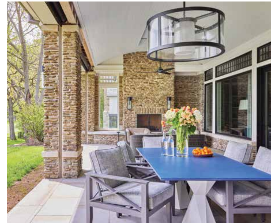
From top: Hammerton's Contemporary chandelier and Cast Classic Club X dining arm chairs in Pindler Bentley denim fabric; a Savory House Woodstock hanging lantern above the entry adds to the home's curb appeal.