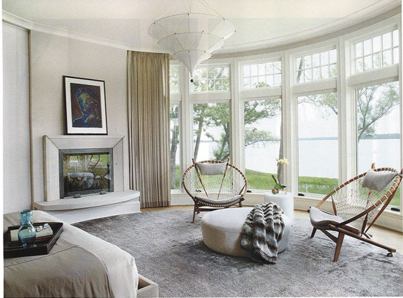
Above: A serene space, the master bedroom's sitting area features chairs purchased at Matt Blatt and a custom-designed ottoman atop a J.D. Staron carpet from Apostrophe Design. Right: The spa-like master bath includes cabinetry painted in Benjamin Moore's Seapearl and limestone countertops from Terrazzo & Marble Supply Companies.