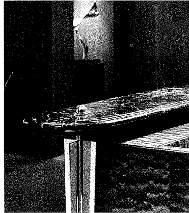
Fujisawa USA, Inc. Deerfield, Illinois The Environments Group