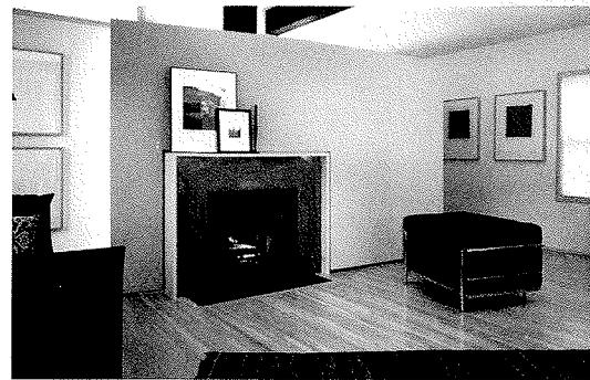
Press Residence Chicago, Illinois Michael J. Pado AIA Architect, Ltd.