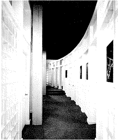
Floyd Photography Studio Chicago, Illinois Johnson and Wilson, Architects (left)