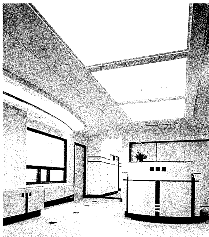
Grippe & Elden Law Offices Chicago, Illinois Powell/Kleinschmidt, Inc.