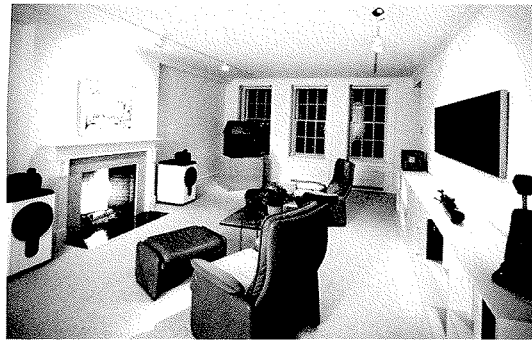
Private Residence Chicago, Illinois Skidmore, Owings & Merrill