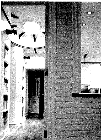
Barnett Residence Chicago, Illinois Hartshorne Plunkard, Ltd.