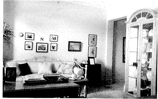
An Architect's Sanctuary Chicago, Illinois Powell/Kleinschmidt (top)