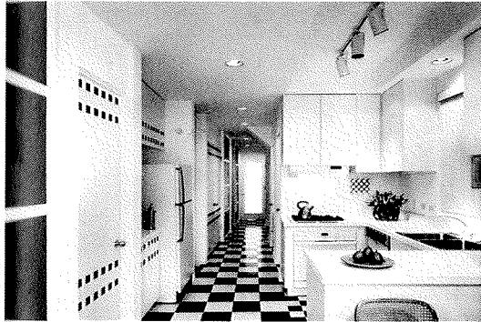
Kohn-Bay Residence Chicago, Illinois Johnson and Wilson Architects